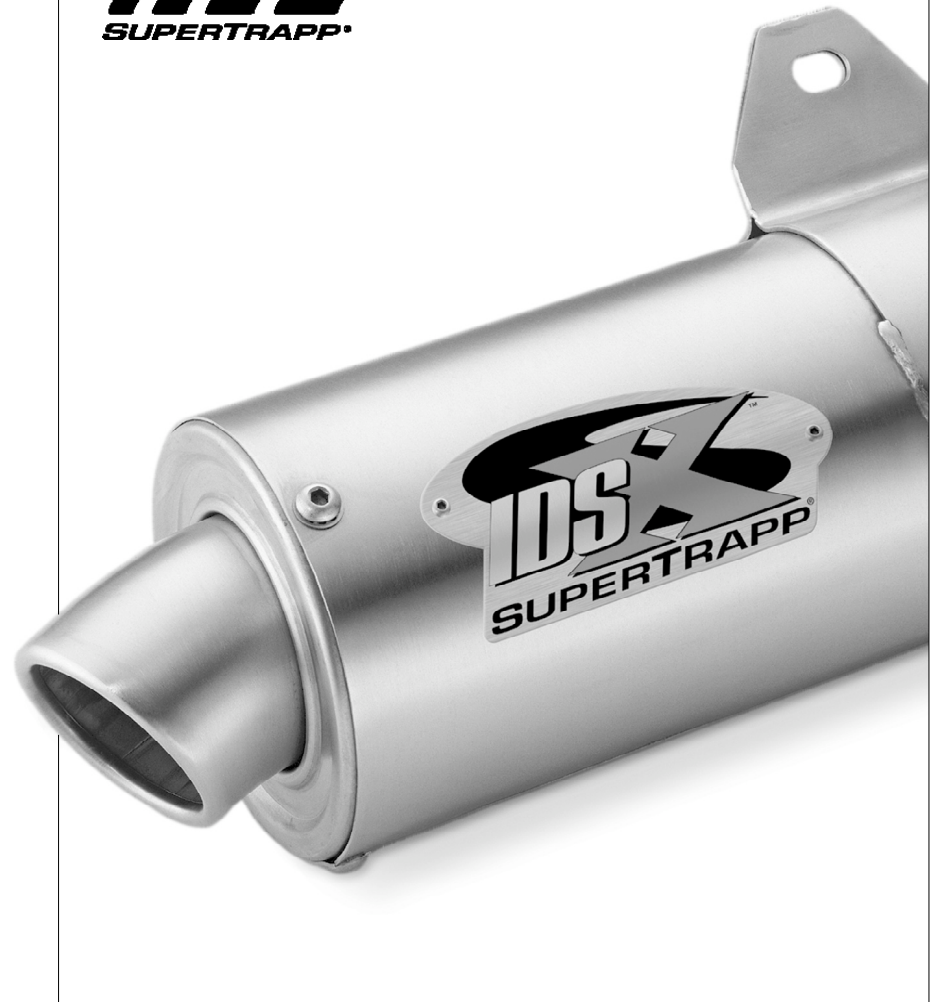
IDSX™ Internal Disc Series