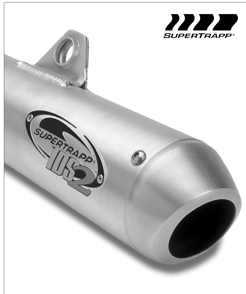
IDS2™ Internal Disc Series