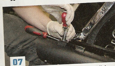
The pipes were attached to the OE pipe mounting bracket at the clutch actuation cover on the right side of the bike.