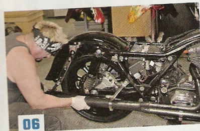
Here's a shot of the header pipes on the bike before the matching ceramic black megaphone and the heatshields went on.